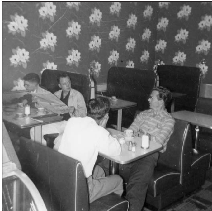
Hanging at The El, ca. 1952.