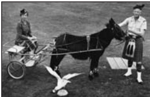
The 1961 Sottish-themed Sittin' Seagulls tournament featured Egad the mule.

The Sittin' Seagulls Tournaments of 1959-68, however, stand as the most unorthodox golf events held at Gearhart. It wasn't really even about golf. It was about people coming together, having fun, doing silly, even surreal things on and around the golf course. For each tournament, a different theme was selected, and participants dressed accordingly: Hawaiian, pirate, kilt-wearing Scots, Spanish bullfighters, etc. Parties