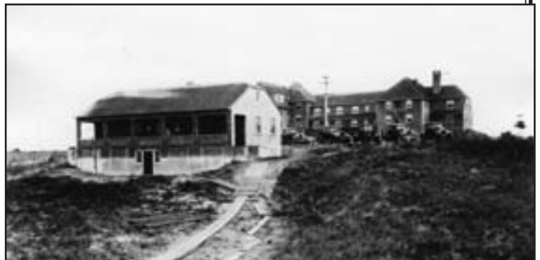
This 1926 image shows the first clubhouse built on the spot of the modern-day Sand Trap. The third and final Gearhart Hotel looms large behind it.

absence of experimentation and shenanigans. Early on, Angora goats were employed for greenskeeping purposes. In 1914, night golf was invented here, or so the claim was made, when late one evening, players arguing about their chipping and putting prowess (perhaps while