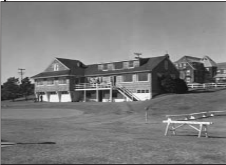
Oh, what a difference two decades can make. This view of the clubhouse, taken from a similar perspective, dates to the 1940's.

flags, and a refreshment-cart-toting mule named Egad.