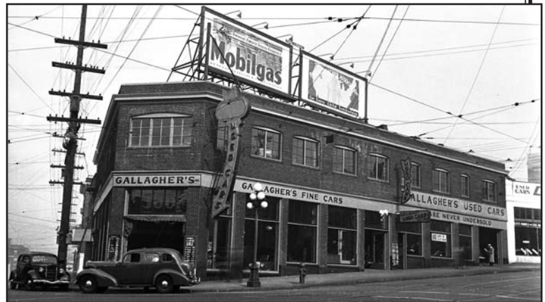
By 1937 used cars were the features seen through Six Arm's windows.

After Peerless vacated to swap brakes for beer, the building remained tied to the auto industry as a series of tenants occupied the building. From 1933 to 1950 it was Gallagher's Used Cars, then Smith Grant Motors from '50 to about 1965. After decades of displaying used cars, an auto body shop moved in. Damaged cars were followed by an engine rebuilding service, and then finally a machine shop. The transition from luxury vehicles to used cars and eventually a machine shop mirrored changes in the auto industry, but it also reflected on the neighborhood itself. By the early 1980s, as a sign of the evolving role of E. Pike Street, an architect, landscape artist and eventually a flower shop moved into this building. In 1995, McMenamins Six