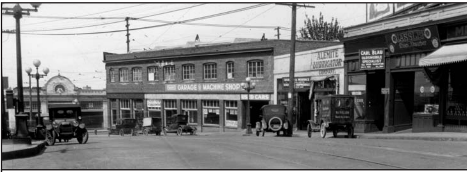
A look west down E. Pike St. from Minor Ave. in 1921 affords a clear view of the Six Arms' building.

business did not retain its grip with the public, and by 1925 the company had been absorbed by another and closed its Pike Street store. Shortly after, Peerless Motor Car moved in to the Six Arms space.